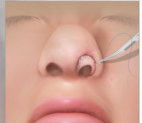
03. Graft sutured in place