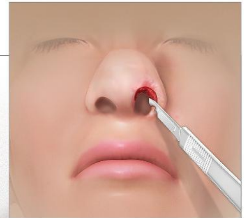
02. Left side of nose prepared for graft