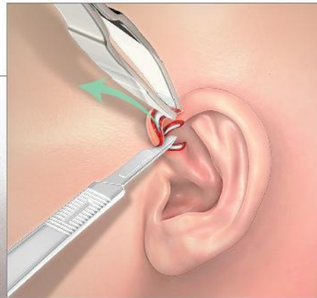
01. Composite graft harvested from left ear