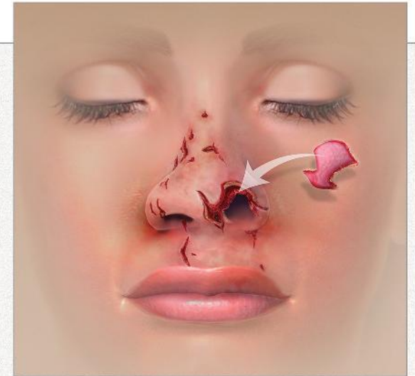
02. Placement of composite graft