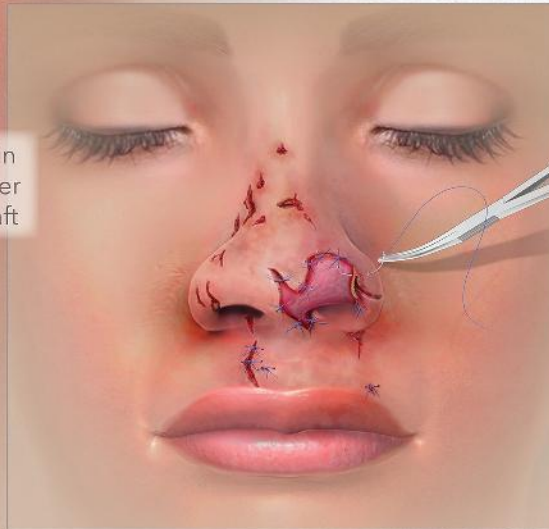
03. Graft sutured in place