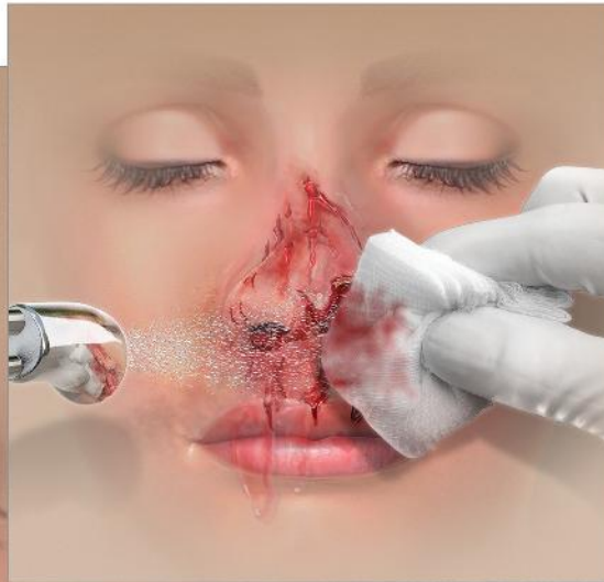
01. Wound irrigated